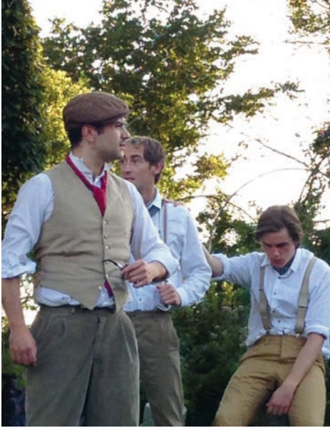
ACTORS IN AS YOU LIKE IT AT MADOO IN SEPTEMBER 2013.