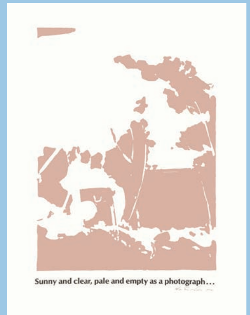
Sunny and clear, pale and empty as a photograph...

This year in the summer studio we will be exhibiting The Garden , a suite of six lithographs by Robert Dash and Poet James Schuyler. The works were produced in 1972 with images created by Dash and text came from Schuyler’s diaries. “The air is like a Cryst-O-Mint” is the caption to one image depicting an open window at Madoo. James Marcus Schuyler was an American poet whose awards include the Pulitzer Prize for Poetry for his 1980 collection The Morning of the Poem . The two met when Dash was an art critic for Arts and Art News ; Schuyler was a frequent visitor to Madoo and a good friend of Dash’s. The exhibition continues through September 5.