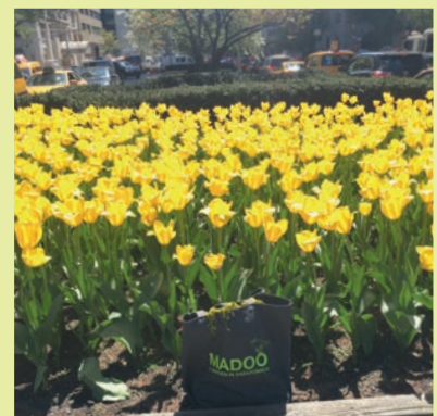
Where is Madoo? Park Avenue Malls, Manhattan, NY