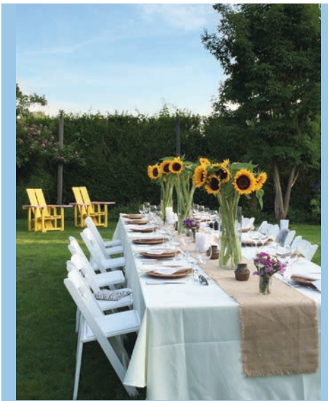
A PRIVATE S2 GALLERY DINNER ON THE SUMMER LAWN FOR YOUNG COLLECTORS LAST SUMMER.