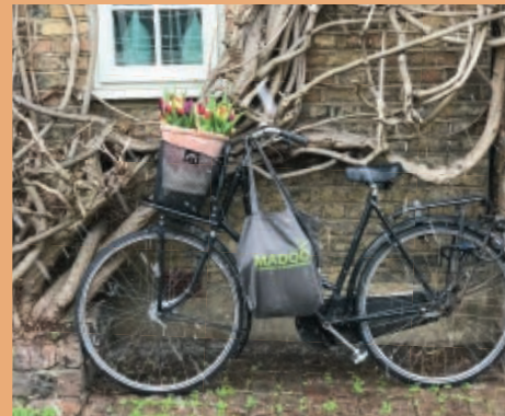
London, England @georgiaetk