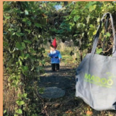
Flanders, New York @steffdetroy

Right here in Sagaponack of course! But our tote also travels the world, as you can see on Instagram. Get yours as a gift with a membership of $250 and up or purchase one at madoo.org and take a photo of it in your favorite locations. Tag your shot with #totes_madoo and @madoogardens and we'll publish it in The Chat!